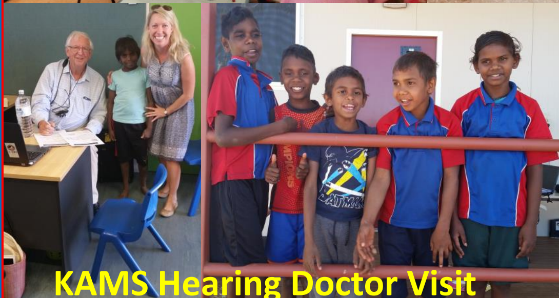
KAMS Hearing Doctor Visit