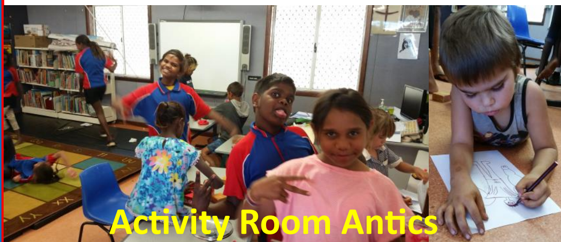
Activity Room Antics

Please contact office for an enrolment form